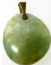
320 Semi-precious stone (jade) pendant with gold mount used to guard against the power of lightning circa 1880 (see image) Sold