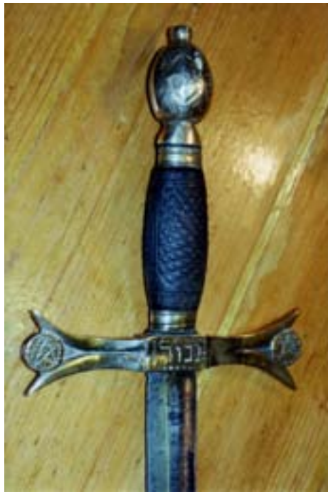
Sword of Nuada*

presumably by Gardner himself, to be more in keeping with the rituals and symbols of Witchcraft.